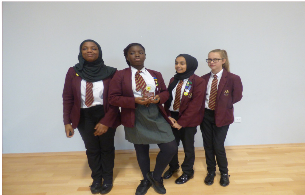
Youth Buzz Awards Runners Up!