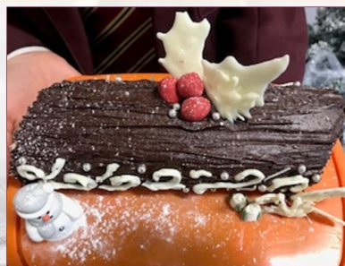
Hospitality and Catering