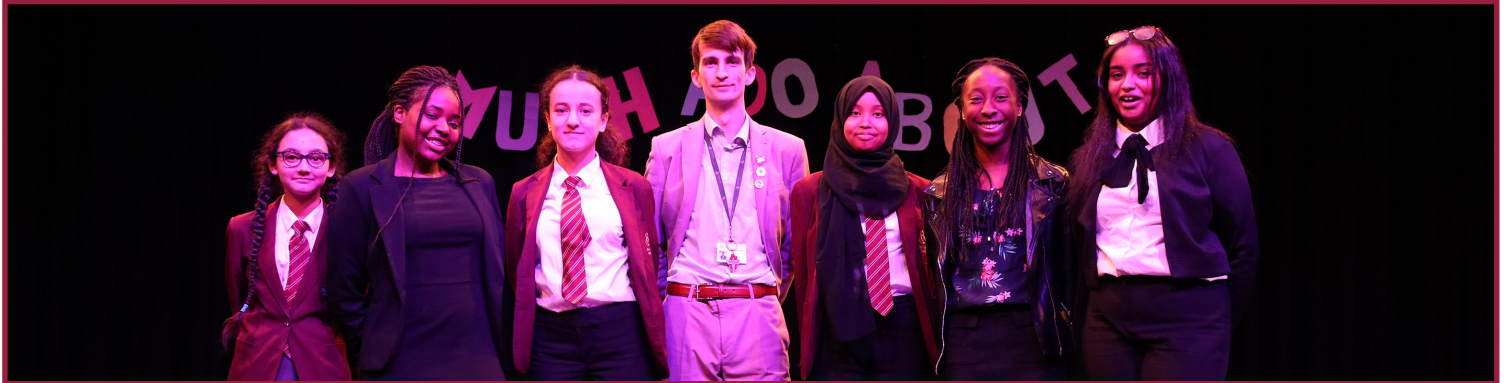
Much Ado About Nothing Director Team

Safeguarding Tip: During achievement week we recognise and reward achievement. 7 th February 2019 Encourage your child to work with another pupil to help them achieve their goals.