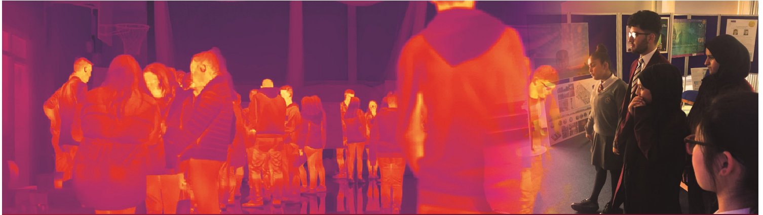
Students enjoyed using a thermal imaging camera at the University of Manchester.

Safeguarding Tip: During achievement week we recognise and reward achievement. 29th March 2019